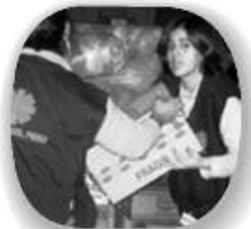
Caritas Peru distribute emergency supplies