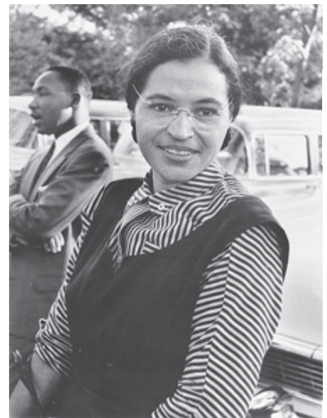
Rosa Parks with Dr. Martin Luther King Jr. in the background, circa 1955.

A one-day boycott of the buses was organised, but it was so successful that it continued for a year. What started as a campaign for more sensitive treatment became a demand for the complete abolition of segregation on the buses. During the year of the campaign many blacks had to walk miles to work each day, and racist whites bombed eight black churches. However, when the State of Alabama finally agreed to desegregate the buses this was seen as the first major victory for the civil rights movement.