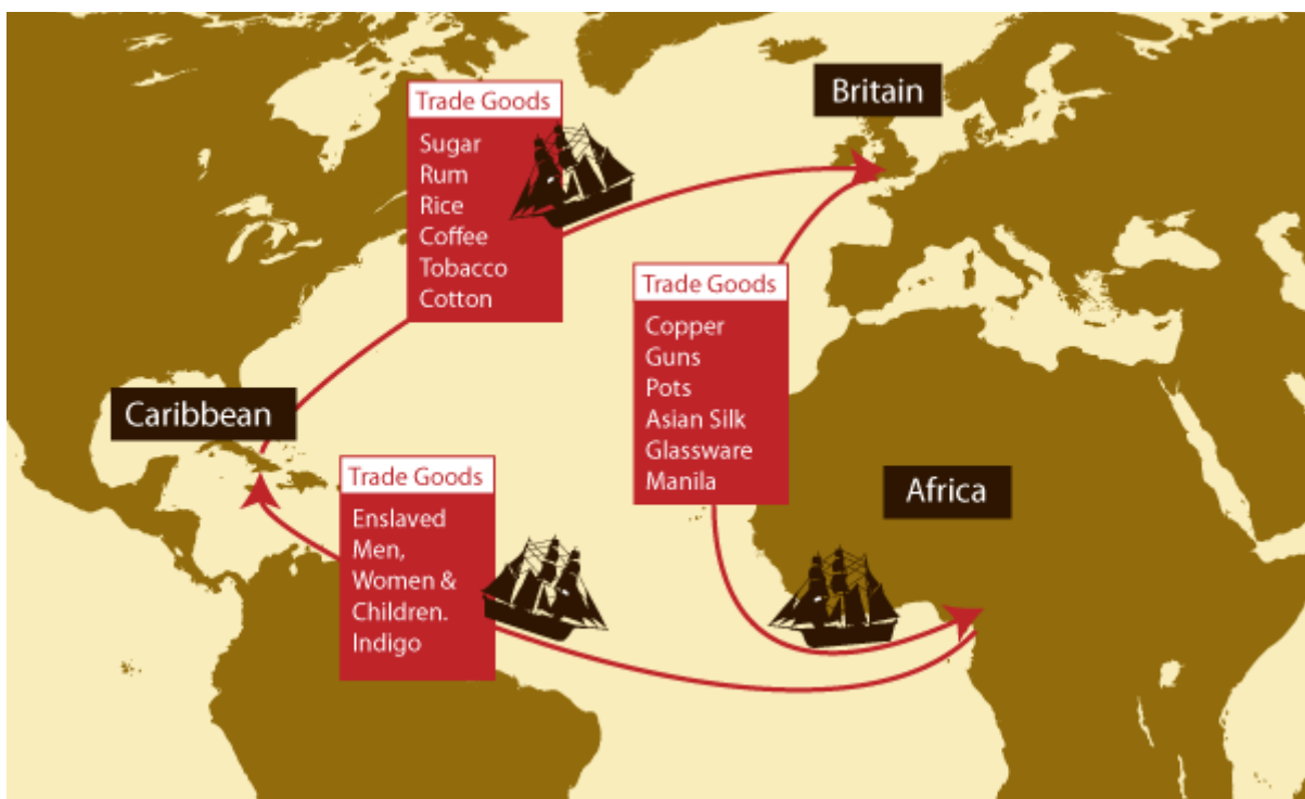
Trading System known as the "triangular trade".

The slave trade, originally developed because of the growing demand for sugar, which lasted in Britain for about 150 years. Irish merchants were part of this trade. By the early eighteenth century, Britain was one of the richest slave trading nations in the world, with large numbers of slaves being transported from African and Asian colonies to Europe and America.