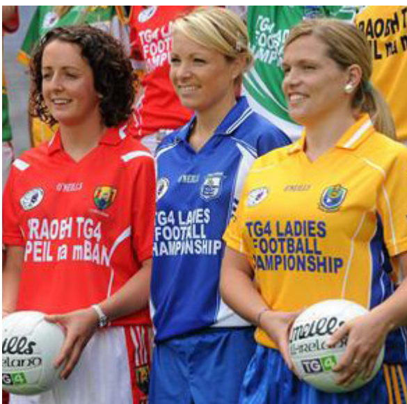
TG4's sponsorship of the Ladies Football All Ireland Championships 2010 and the tenth year of the Ladies Football finals being televised by the National Irish Language Broadcaster.

—FA's ruling council statement, December 1921