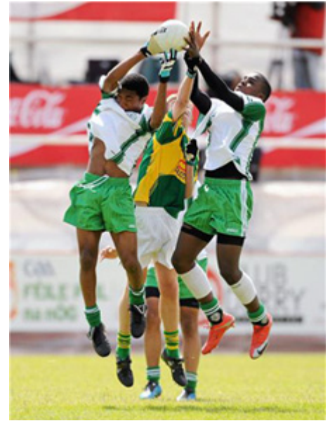
Coca-Cola GAA Féile Peil na nÓg Finals 2010.

In the 1970s and 1980s players experienced it in the stadium while in the 1990s and today they experience it outside the ground. On the video many players reveal that they are subject to racism outside the game because of the work inside the game has had an impact, but revealingly showing that there is a lot of work to do in society.