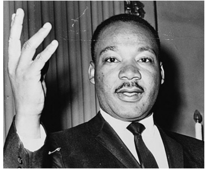
Dr. Martin Luther King Jr. (1929-1968), Most Famous Leader of American Civils Rights Movement.

The churches, which played an important role in the life of the black community, were used to organise the campaign. One of the ministers asked to lead the protest was Martin Luther King. He went on to become the most famous leader of the civil rights movement.