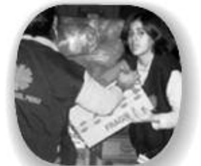
Caritas Peru distribute emergency supplies