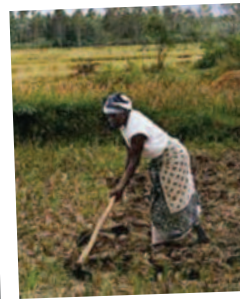
Namangolwa Kandala in her Casava field, Zambia.

Agriculture is the primary source of income for about 65 per cent of Africans. Since small scale farms account for more than 90 per cent of Africa's agricultural production and are dominated by the poor, growth must be centered on the small farmer. Improvements in road and transportation networks, increased access to markets and better coordination among farmers, traders and buyers are critical to improving overall food production leading to increased supply and reduced prices.