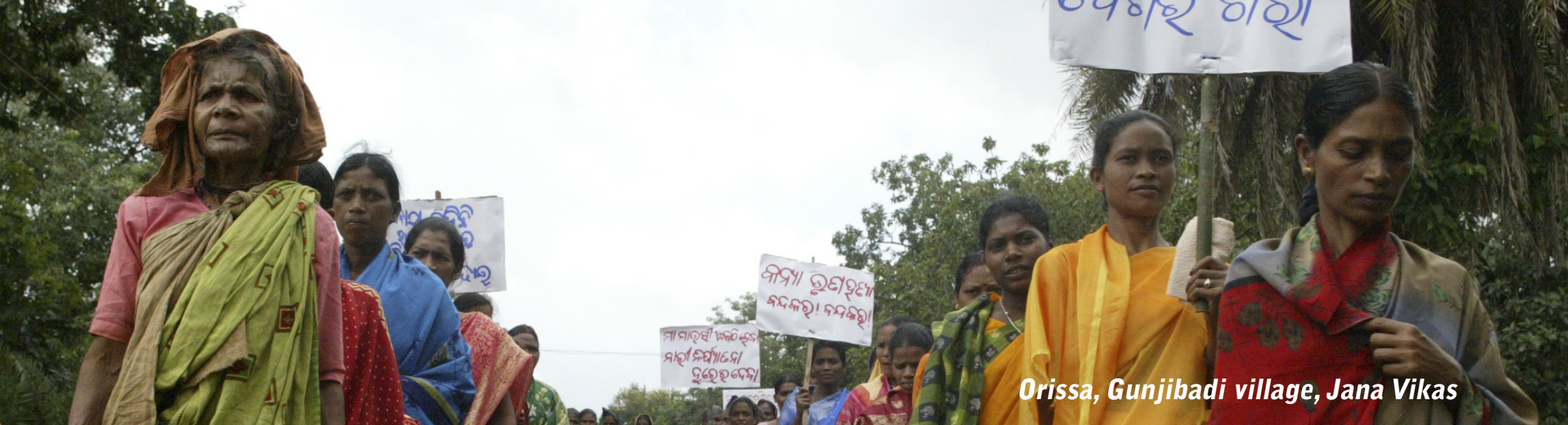
Orissa, Gunjibadi village, Jana Vikas