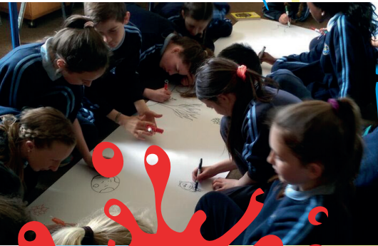
Drawing global connections