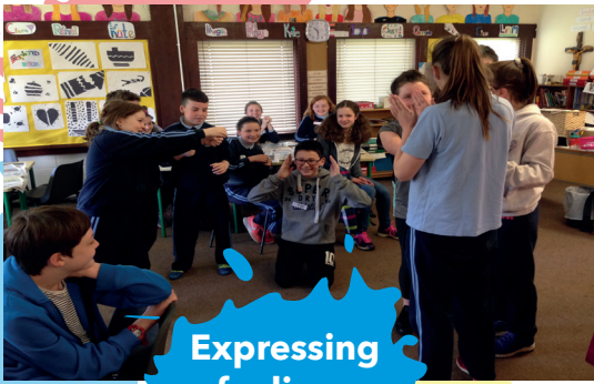
Expressing feelings & ideas