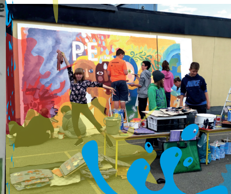
Young artists at work